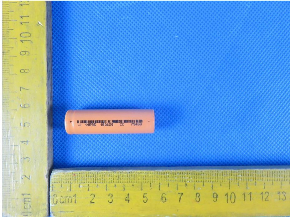
Figure 1 Front view of Cell