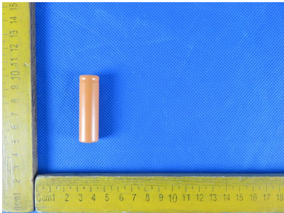
Figure 2 Back view of Cell